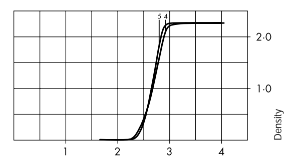
Relative log exposure

MULTIGRADE RC WARMTONE glossy or pearl paper exposed through filters 00, 0, 1, 2, 3, 4 and 5. Developer: MULTIGRADE diluted 1+9. Development: 1 minute at 20°C/68°F.